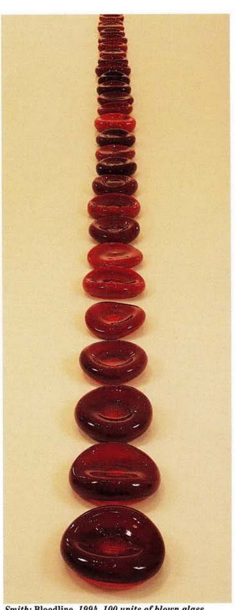
Smith: Bloodline, 1994, 100 units of blown glass, each unit approx. 8 inches in diameter, overall dimensions variable.

Serrano's interest in the transfiguration of the abject is most clearly revealed in his series called