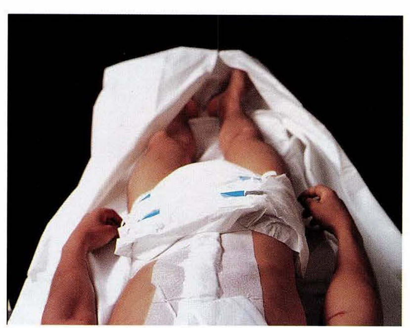
Serrano: The Morgue (Gun Murder), 1992, Cibachrome print mounted on Plexiglas, 49% by 60 inches.

For certain contemporary women artists, Catholicism's vision of continuity between the corporeal and the divine seems to offer an alternative to '70s-style feminism with its insistence on what now seems a false dichotomy between female and male, body and mind, nature and culture. The legacy of