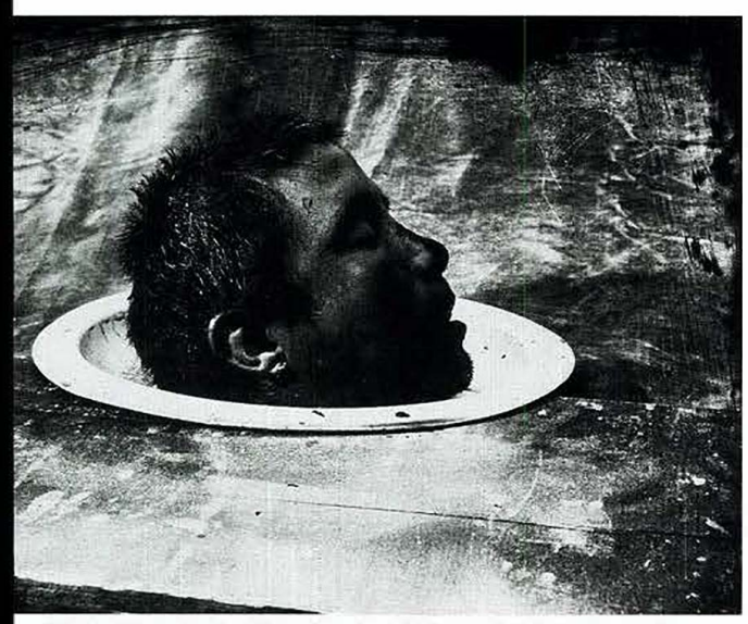
Witkin: Head of a Dead Man, Mexico, 1990, gelatin silver print with encaustic, 25% by 32% inches. © Joel-Peter Witkin, courtesy PaceWildensteinMacGill, New York, and Fraenkel Gallery, San Francisco.

Catholicism's female mystics also offers an alternative to more recent feminist stances which assert that gender is simply a construct and that representations of the female body are merely reinforcements of patriarchal power. Such notions dissuaded a generation of theoretically inclined women artists from considering the body as a source of knowledge and meaning. The work of Kiki Smith provides an example of a woman artist who has found a middle way between these two extremes. Not surprisingly, one of her sources is Catholicism.