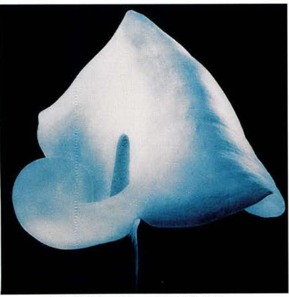
Mapplethorpe: Flowers (Blue Calla Lily), 1987, photogravure, 20 by 24 inches.

While none of the artists under review are practicing Catholics, undercurrents of Catholicism subtly pervade their work, frequently emerging in a mixture of the sacred and profane.